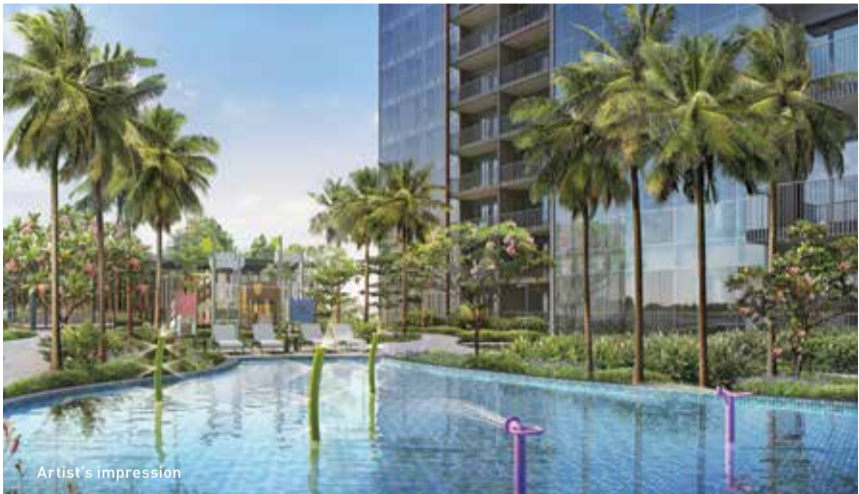
Children's Play Pool

Plunge into the Family Pool for a leisurely swim. Lounge in the clubhouse while the kids have a good time splashing about in the Children's Play Pool. Or join them in water games with in-built water play equipment.