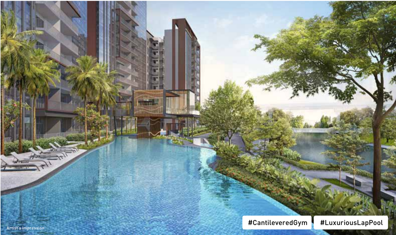
50m Lap Pool

THE WATERFALLS SPECTACULAR VIEWS ABOVE, TRANQUIL WATERS BELOW