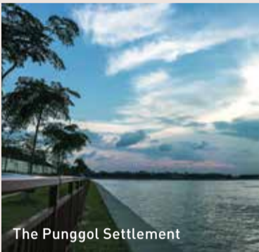
The Punggol Settlement