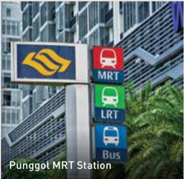
Punggol MRT Station