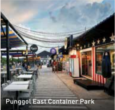
Punggol East Container Park