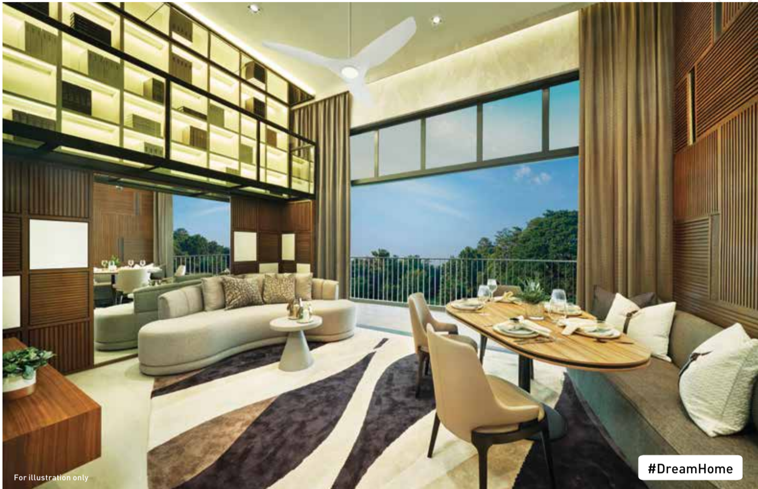
Efficient living room layout for family bonding

At Piermont Grand, every residential tower is designed with unique curtain wall feature, embracing the architectural design as seen in high-end residences. Inside each unit, the layout is carefully planned to provide optimised spatial planning for the family. For selected units, high ceilings will undeniably add to the comfort of being at home.