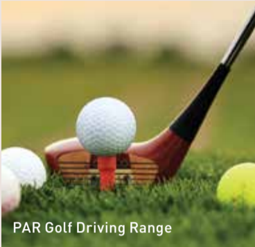
PAR Golf Driving Range