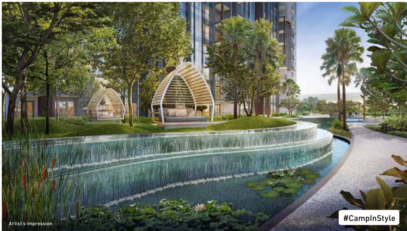
Rolling Lawn and Cabanas

Chill out under the stars on a verdant lawn. Glamp out in your pick of quaint cabanas. Step into the hydrotherapy pool to relieve sore muscles with a relaxing spa experience.