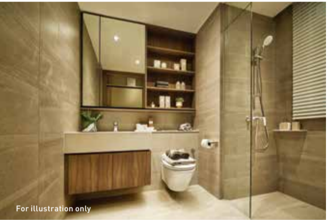
Luxurious bathroom with quality fittings

Before relaxing in the bedroom, you can unwind with a shower in a bathroom that comes equipped with quality fittings from GROHE. Discover an attractively curated accessory cabinet and full-height mirror integrated within your master bedroom wardrobe. For selected units, you can even delight in a roomy walk-in wardrobe space.