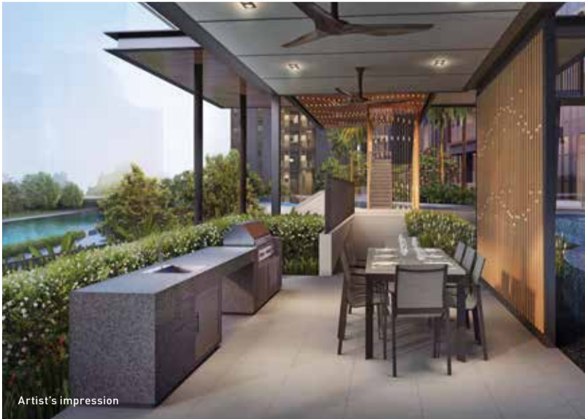
Lookout BBQ Pavilion

THE WATERFALLS SPECTACULAR VIEWS ABOVE, TRANQUIL WATERS BELOW