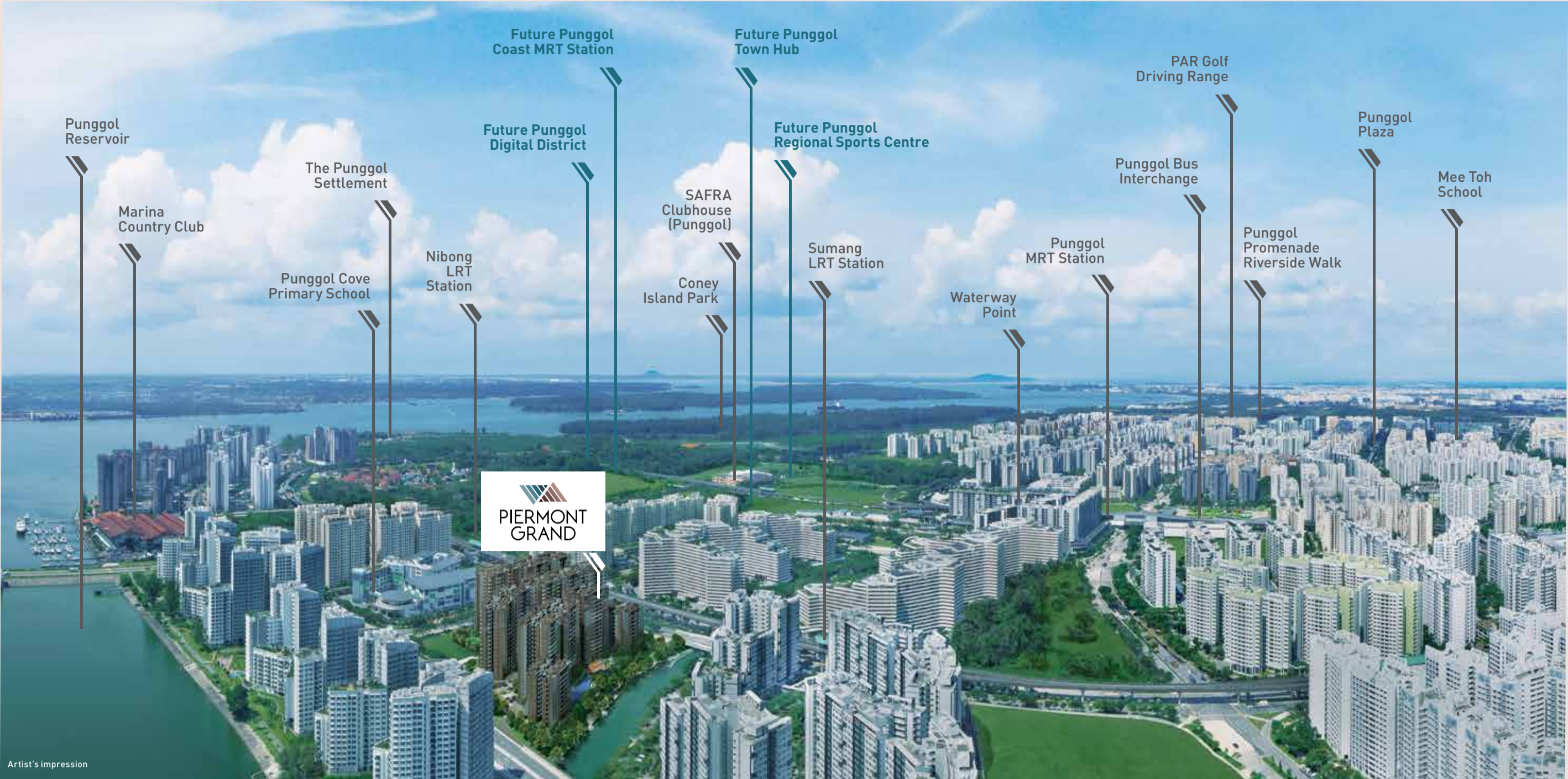
The locations of future and existing amenities indicated in the photograph are approximate and for reference only.