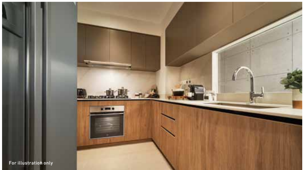
Well-equipped for culinary delights with branded appliances

Go from being a master chef to becoming the perfect host for dinner gatherings with branded kitchen appliances from Teka. For the 4- and 5-bedroom units, a kitchen island is also provided to further complement your ideal home.