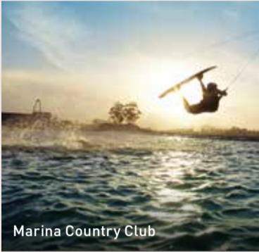
Marina Country Club

From trekking, wakeboarding, and yachting opportunities to cafe-hopping options amongst trendy eateries, Punggol is quickly becoming the definitive hangout for both exercise enthusiasts and fanatic foodies.