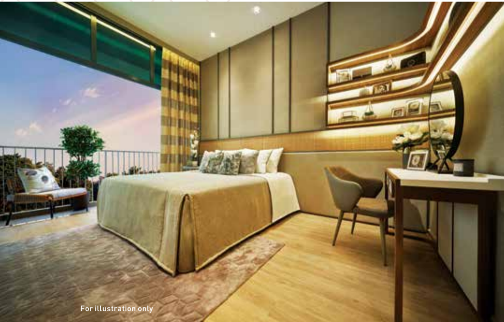
A stylish sanctuary for restful slumber

Go from being a master chef to becoming the perfect host for dinner gatherings with branded kitchen appliances from Teka. For the 4- and 5-bedroom units, a kitchen island is also provided to further complement your ideal home.